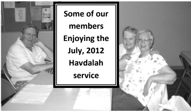
Some of our members Enjoying the July, 2012 Havdalah service

The church always includes a notice of our Friday night services in all of their newspaper advertising. For that, we thank them sincerely.