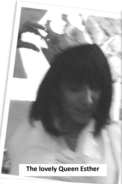
The lovely Queen Esther